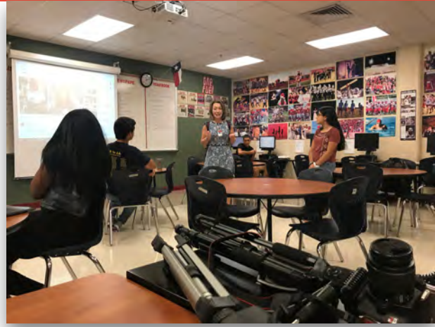
Engaging With Students