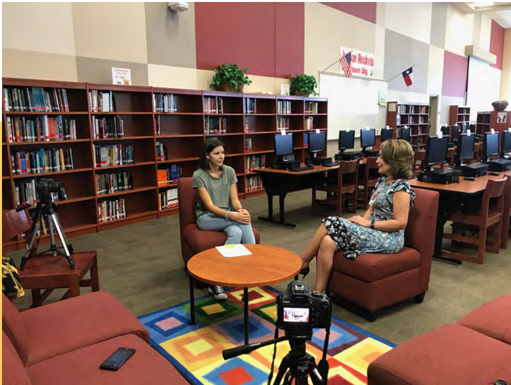
One On One Interview With The Superintendent