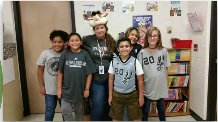
Students Celebrate Manu!

Students and staff at Hopkins Elementary School made their feelings known in celebration of Manu Ginobili Day. There are a lot of Spurs fans here!